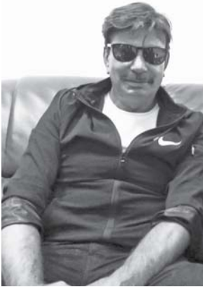
sequence at Tsomgo.

The team is also scheduled to shoot a song