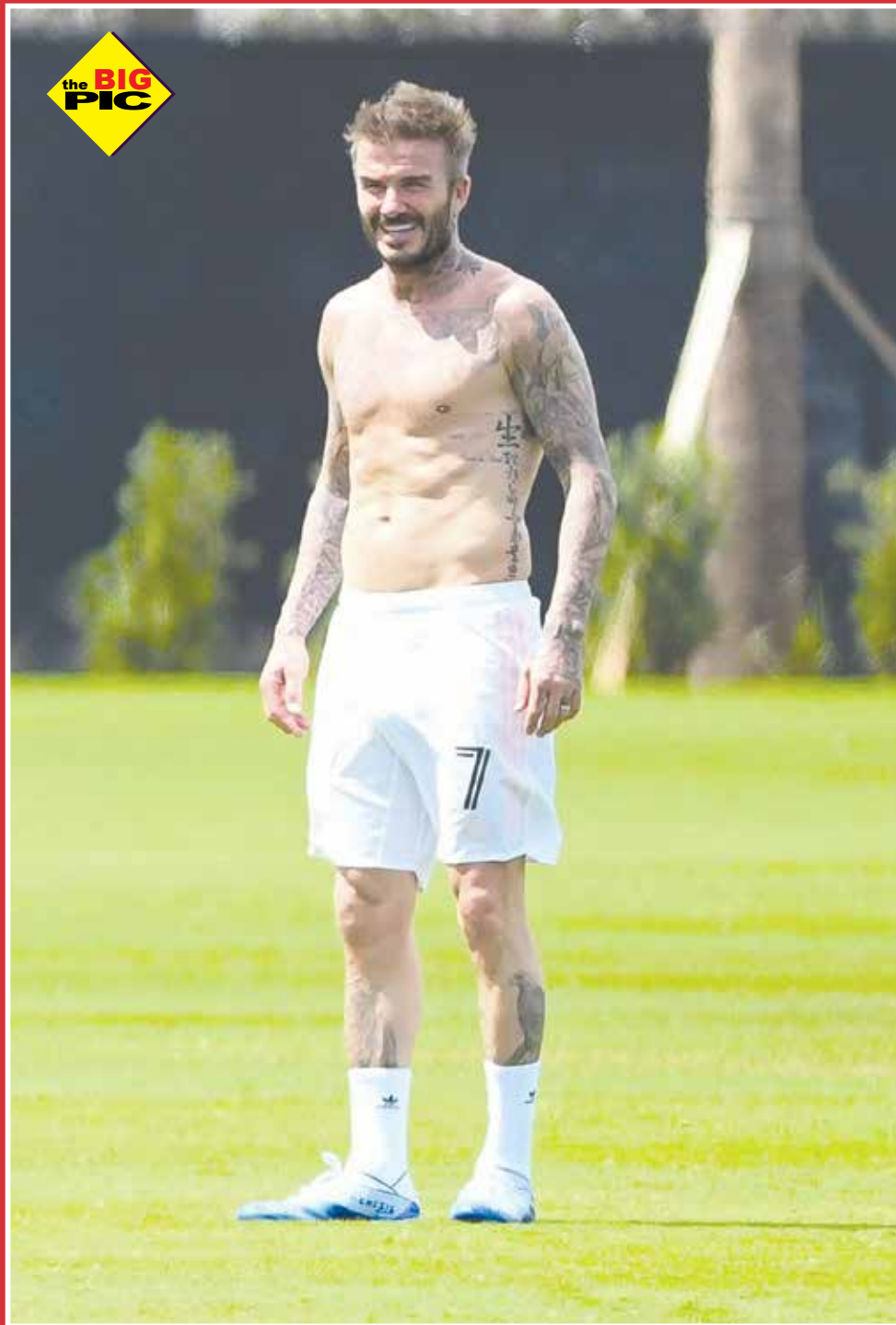
GAME ON! The soccer star, David Beckham goes shirtless for a kickaround at the Inter Miami CF Stadium in Florida.