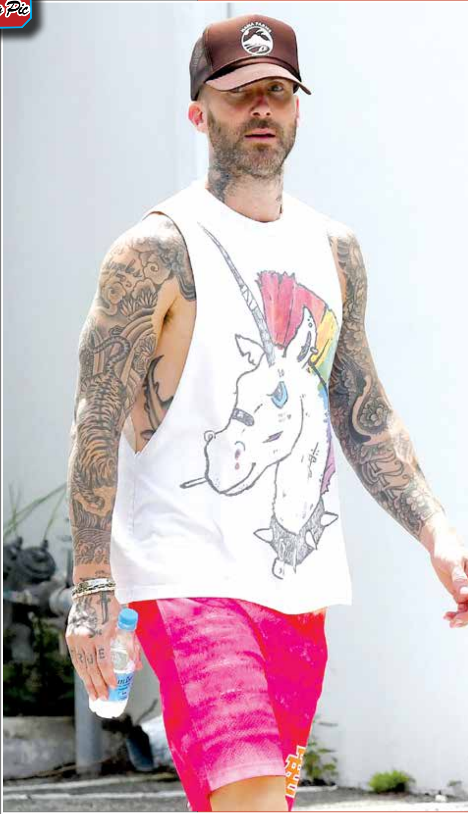
FEELING VIBRANT! The singer, Adam Levine opts for a bright outfit while heading to the gym at Miami Beach.