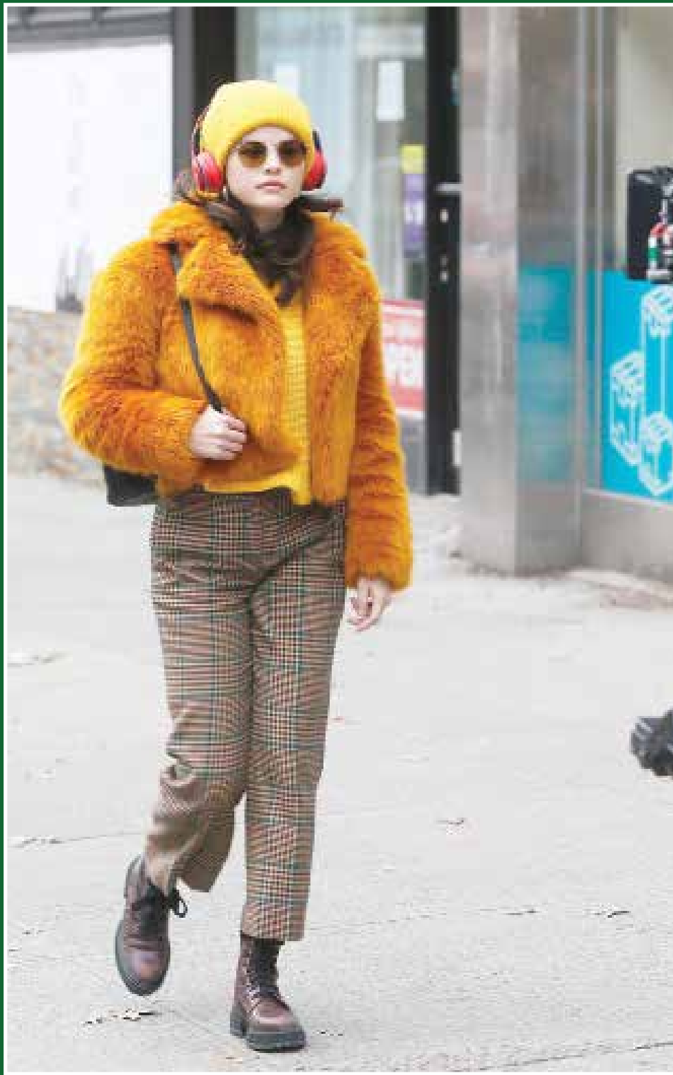
HOLIDAY SHOPPING! The actress, Ana de Armas steps out in a casual white tee and yellow paisley printed pants while shopping on Promenade Street in Santa Monica.

“I loved the ways you welcomed the dreamscapes and tragedies and epic tales of love lost and found into your lives. So I just kept writing them.”