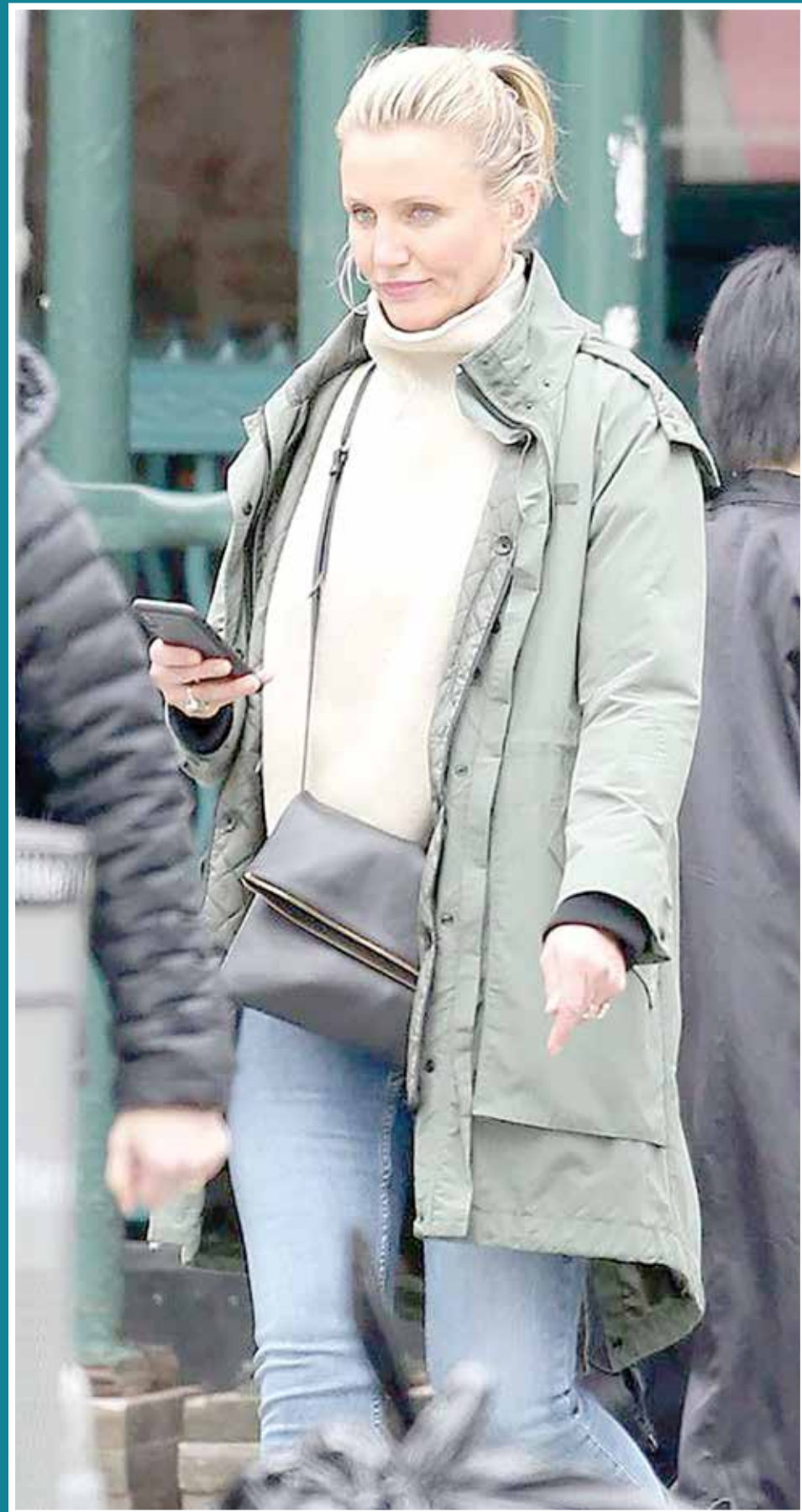
DIAZ DAYS! Cameron Diaz takes a stroll around town in The Big Apple.

Herbert's novel was previously made into a film in 1984 by David Lynch but was a box office disappointment. Troubled by rewrites and the alleged meddling of the studio, Lynch had removed his name from the film.