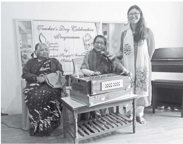
"I am deeply touched by her thoughts and initiatives towards music. She has worked hard to educate the students in the field of music," she shared.