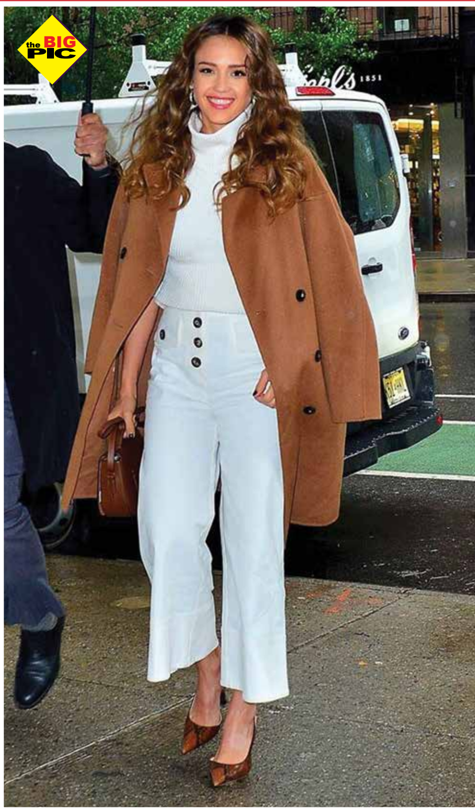
RAINY DAY GLOW! The actress, Jessica Alba is all smiles while doing her rounds of visits in The Big Apple.