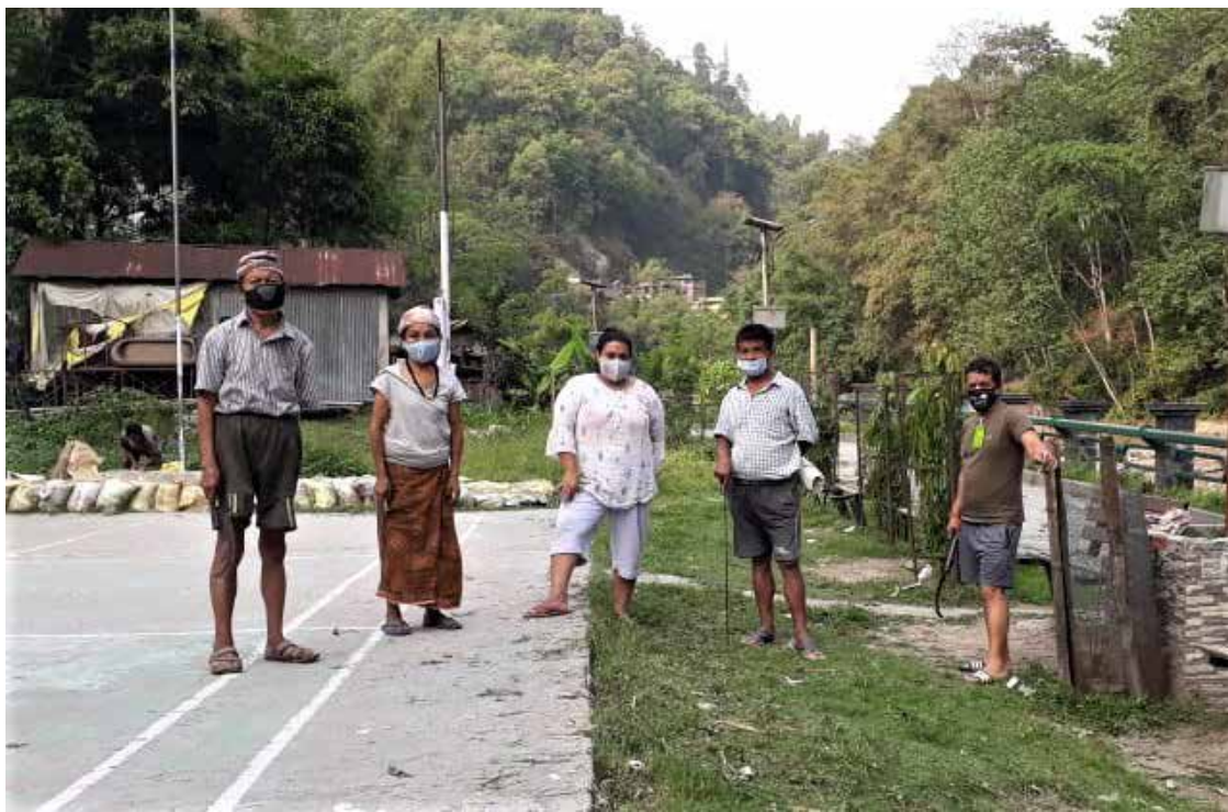
Shantinagar Gaon Sudhar Samiti undertakes cleanliness drive at badminton court and surrounding areas on Monday.