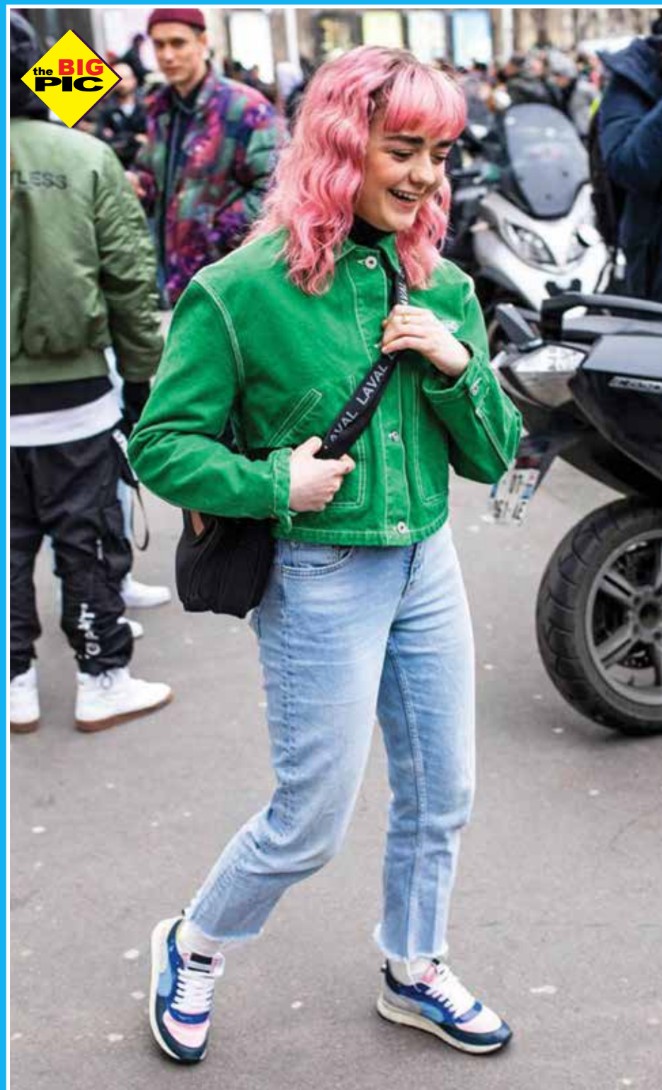
ARYA WHO?! The Game of Thrones star, Maisie Williams, switches up her style (and hair color) during Paris Fashion Week.

Despite their separation, Fergie and Duhamel, 46, have been dedicated to co-parenting their son, Axl Duhamel (five).