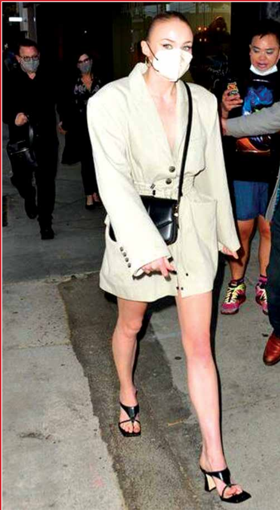
STREET STYLE! Actress Sophie Turner turns heads in an oversized khaki blazer and black accessories in Los Angeles.