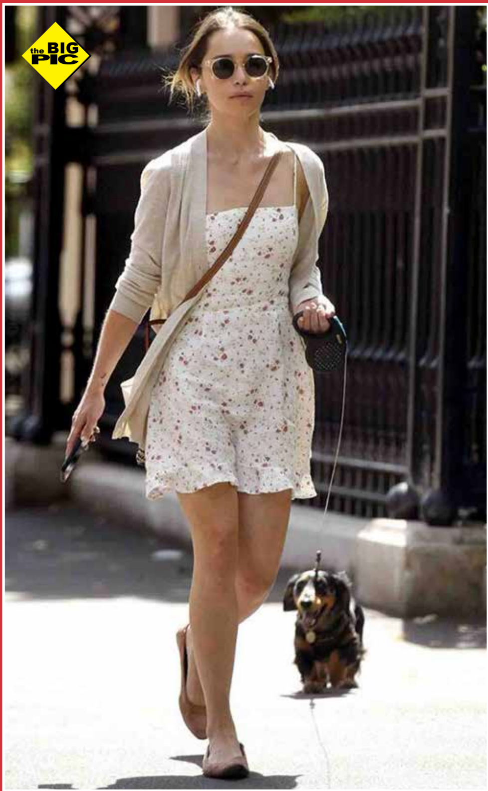
MOTHER OF DOGS! The Game of Thrones actress, Emilia Clarke is seen walking her adorable dachshund in London.