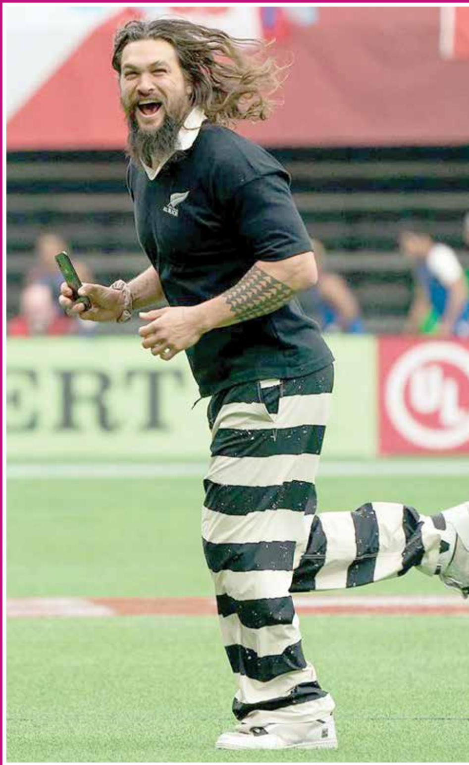
IN THE FIELD! Aquaman star, Jason Momoa, supports the New Zealand All Blacks Sevens rugby team in Vancouver, Canada.