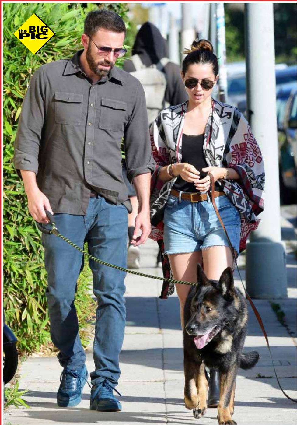
DAILY DOG WALK! The duo, Ben Affleck and Ana de Armas walked their dogs in Los Angeles.