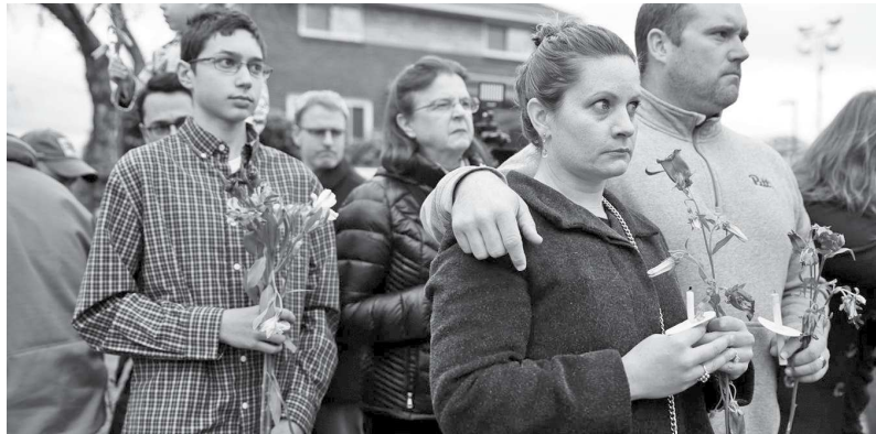
People place flowers at the Tree of Life synagogue in Pittsburgh.

In August 1882, Congress responded to increasing concerns about America's "open door" policy and passed the Immigration Act of 1882, which included a provision denying entry to "any convict, lunatic, idiot or any person unable to take care of