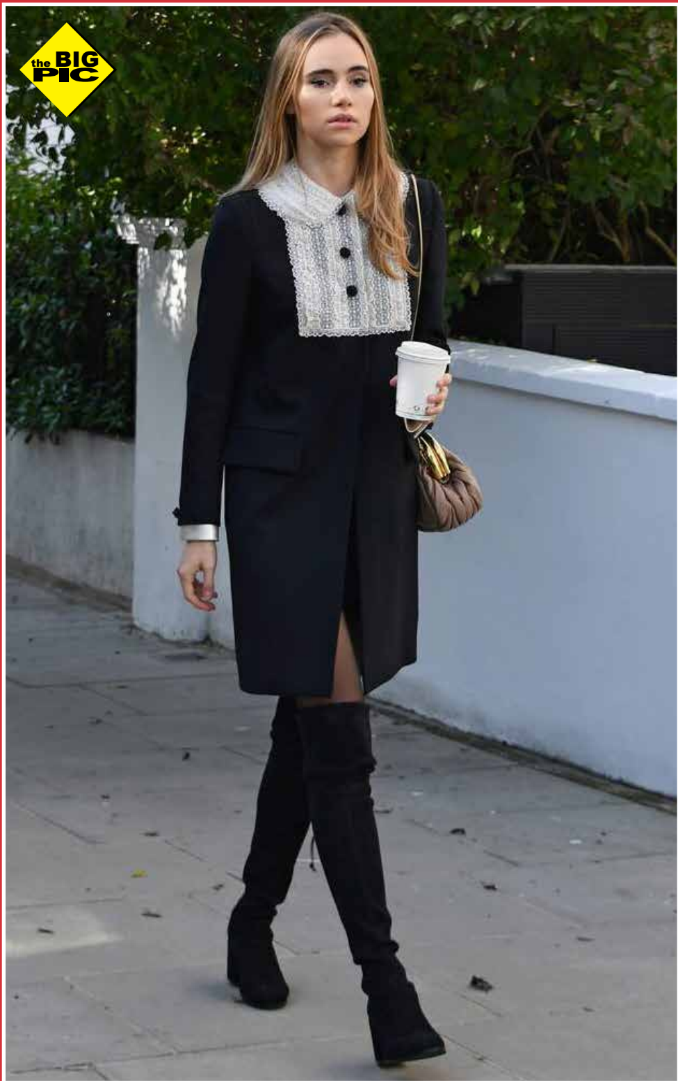
SWEET SUKI! The model, Suki Waterhouse steps out in a black and white dress while walking in Notting Hill, London.