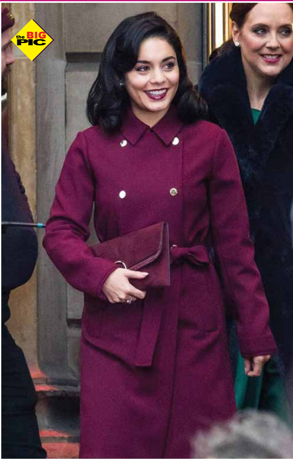
LOOKING LOVELY! The actress, Vanessa Hudgens wears a berry colored ensemble while out filming for The Princess Switch: Switched Again in Edinburgh, Scotland.