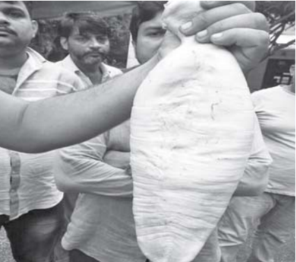
Lasting 20 minutes, the auction ended with an exporter quoting Rs 5.5 lakh just for the fish’s innards.

two decades and had only heard about such a huge ghol fish. But, with this fish catch, we actually had a wonderful experience and it also got sold for a good price,” they said.