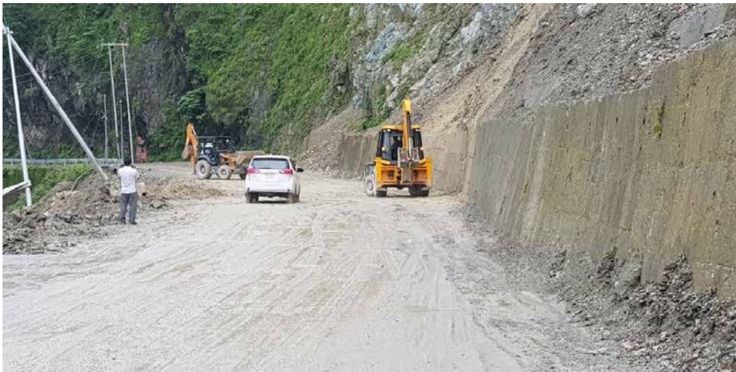
SETI JHORA CLEARED, FOR NOW: Finally, after five days of uncertainty two-way traffic was restored at Seti Jhora on Sunday afternoon. A break in the rain and the courage and diligence of West Bengal PWD's JCB pilots helped clear the debris enough for vehicles to get unimpeded travel through the area.