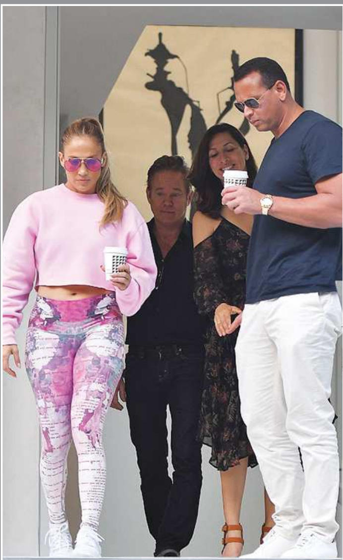
PRETTY IN PINK! Things seem to be moving fast for Jennifer Lopez, 49, and Alex Rodriguez, 43, as the pair were seen house-hunting together in Beverly Hills.

Sonu Sood has decided to opt out of Kangana Ranaut's much-ambitious project Manikarnika: The Queen of Jhansi, and said it was because of a scheduling conflict. The actor who was reportedly playing Sadasivrao Bhau is currently filming Rohit Shetty's Simmba and was in a fix because he was asked to reshoot portions by Kangana. Apart from dates, another thing that didn't go well is the fact that he had to sport a clean shaven look for the period film. However, the 45-year-old actor has beard look for Simmba. Hence, the step. However, it seems like there is more to it. Buzz of the town is Sonu had a tiff with his co-star Kangana Ranaut who was recently in news after the clapboard with her name as director went viral. Apparently, the credit controversy was just the tip of the iceberg because a fresh salvo of shots have been fired. According to Pinkvilla