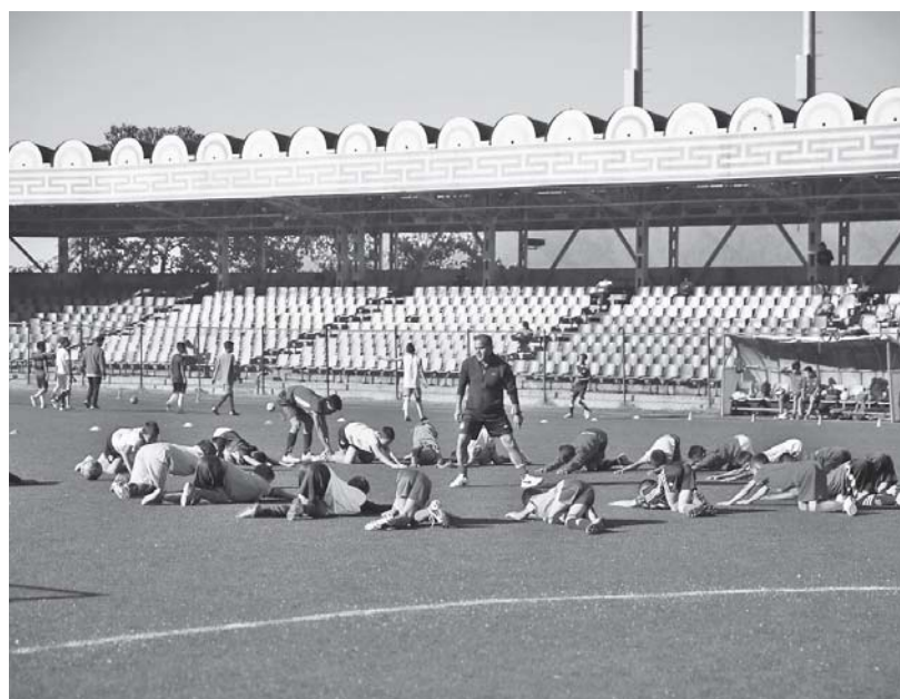
KIDS TO PITCH: Instructors share game tips with young kids at Paljor Stadium during the Kids to Pitch initiative of a group of likeminded sportspersons. Every Sunday, kids aged between 6 to 12 years get exclusive access to the stadium and learn about sports and are treated to some proper physical activities by a team of indulgent coaches. Today was the fourth Sunday of the kids-to-pitch initiative.

Various cultural performances were also presented during the event.