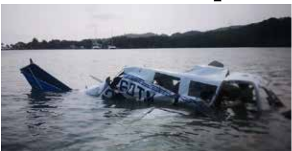
Cove, a few minutes after taking off from the

TEGUCIGALPA, MAY 19 (AFP): Four Canadians and an American pilot died Saturday when their small plane plunged into the sea off the Honduran island of Roatan where they were vacationing, firefighters said. The plane crashed near the town of Dixon