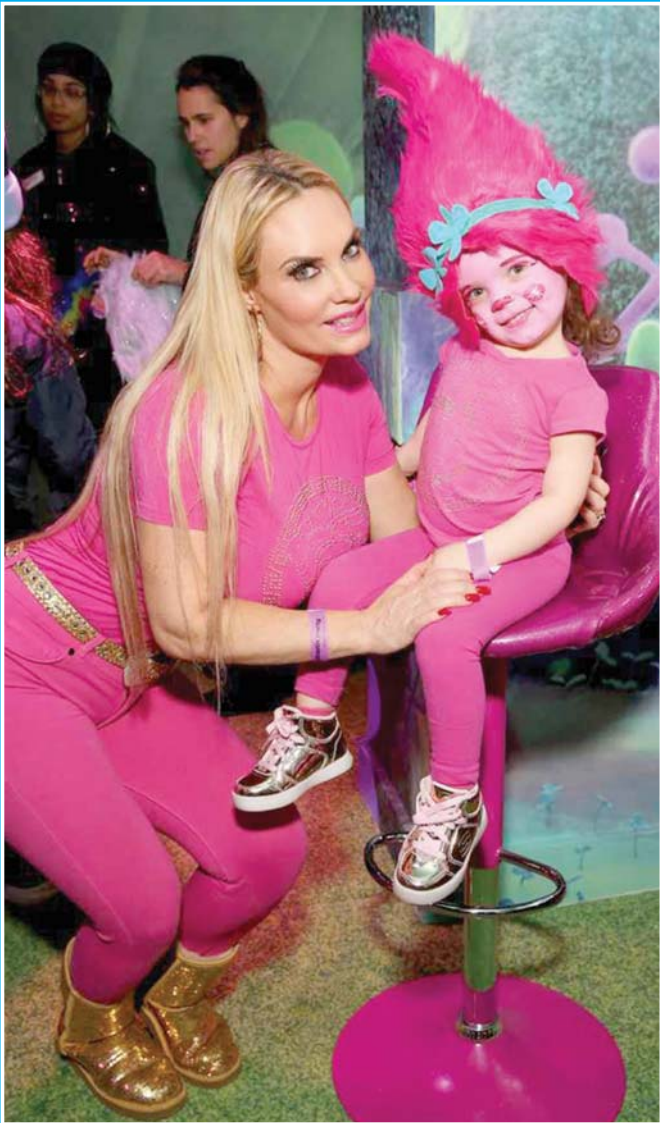
TROLLIN' AROUND! The mother-daughter duo, Coco Austin & Chanel, have some fun at DreamWorks Trolls The Experience Rainbow Carpet Grand Opening in NYC.