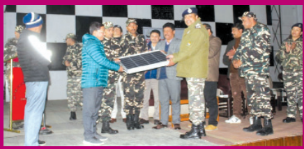
SSB RHENOCK DISTRIBUTES SOLAR STREET LIGHTS Page 02