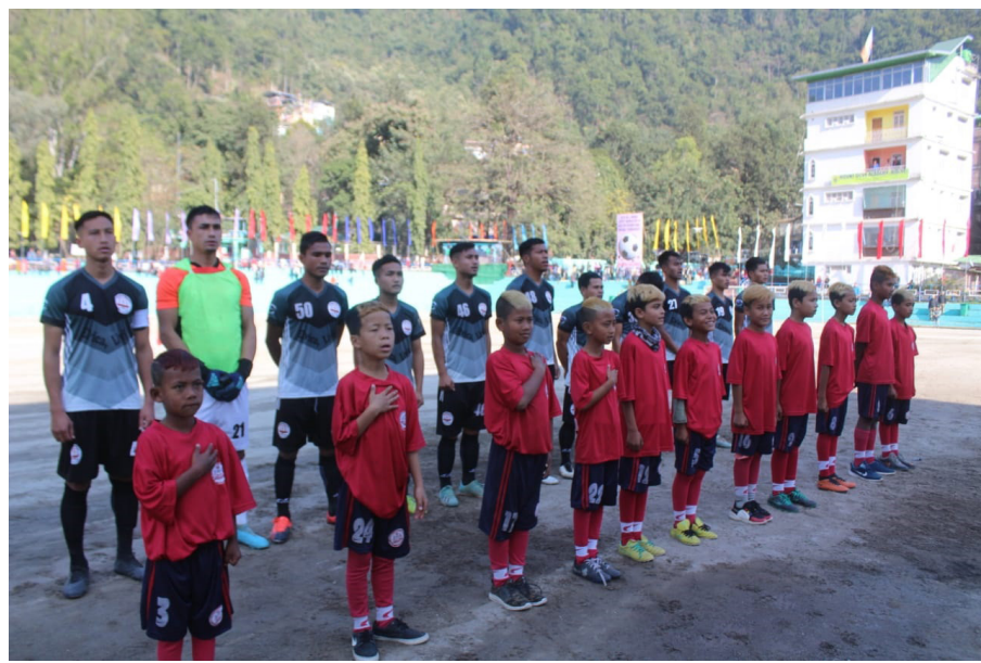
the chief guest and guest of honour during the programme.