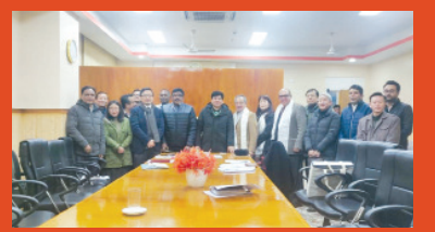
OPPORTUNITY FOR SIKKIM'S YOUTH TO WORK IN JAPAN pg 03