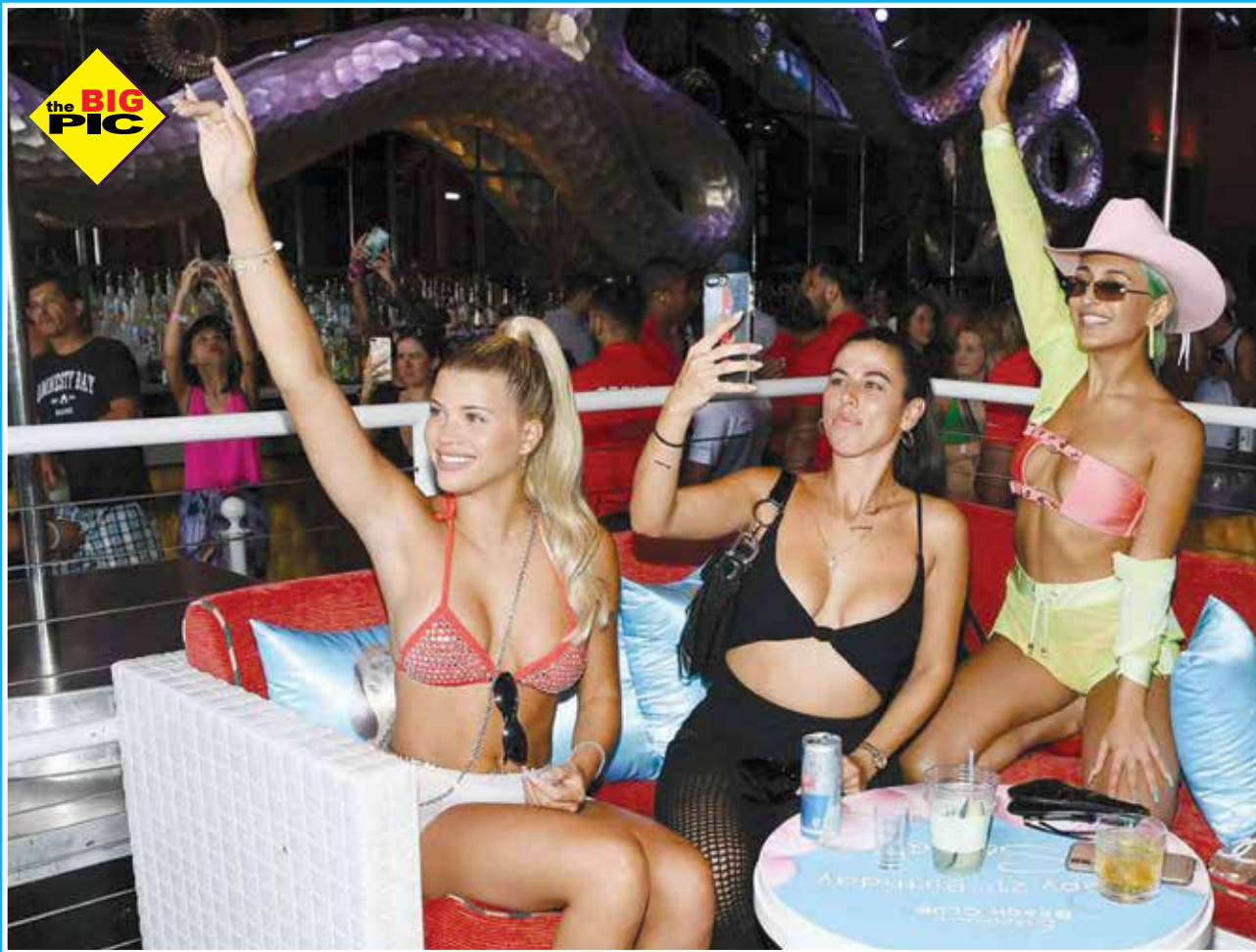
HAPPY BDAY! The model, Sofia Richie celebrates her 21st birthday with friends at Encore Beach Club at Wynn Las Vegas.

Tried to improve in comedy by leaps and bounds: John Abraham