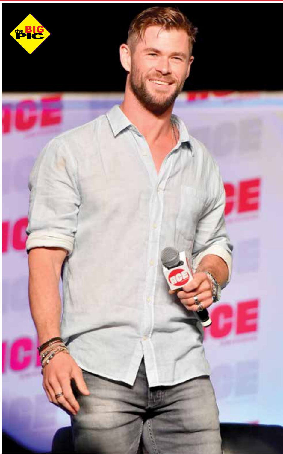
HANDSOME HEMSWORTH! The actor, Chris Hemsworth takes the stage for a Q&A panel at the 2019 ACE Comic-Con at Rosemont, Illinois.