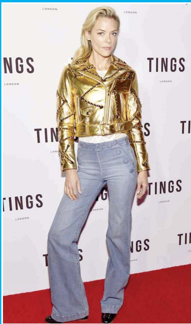
METALLIC MOTO! Actress Jaime King is seen in a metallic gold motorcycle jacket and high-waisted jeans at the TINGS Magazine Issue 2 Launch Event Hosted By Rae Sremmurd at 10AK in West Hollywood.