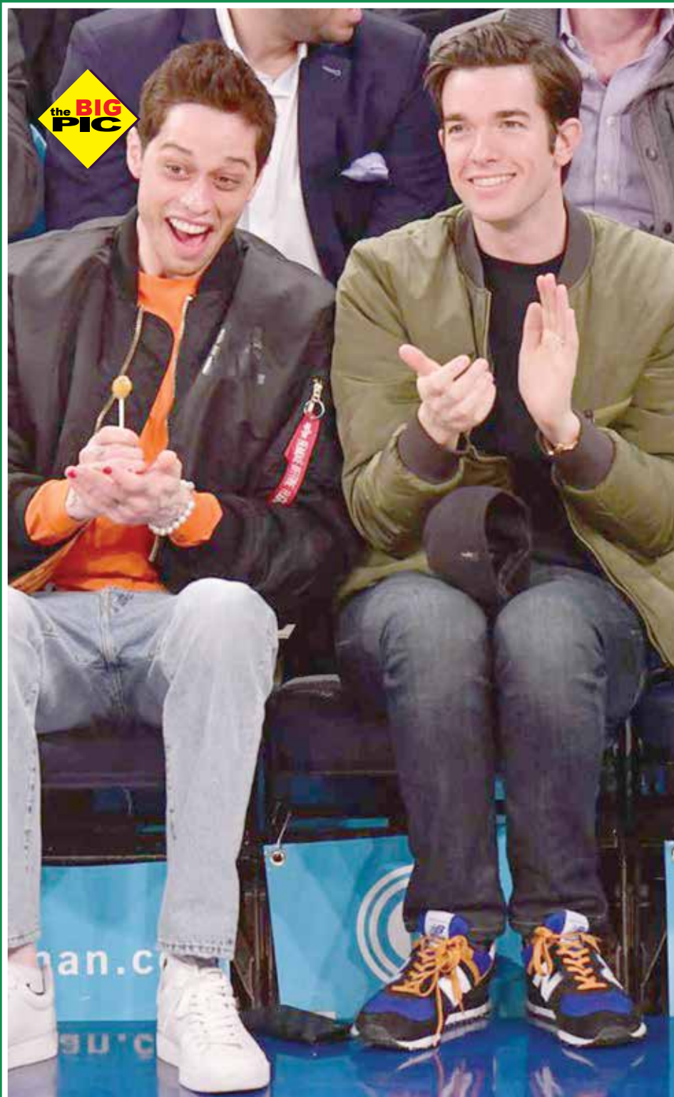
NICE GAME! The friends, Pete Davidson & John Mulaney enjoy a Knicks match together in the Big Apple..