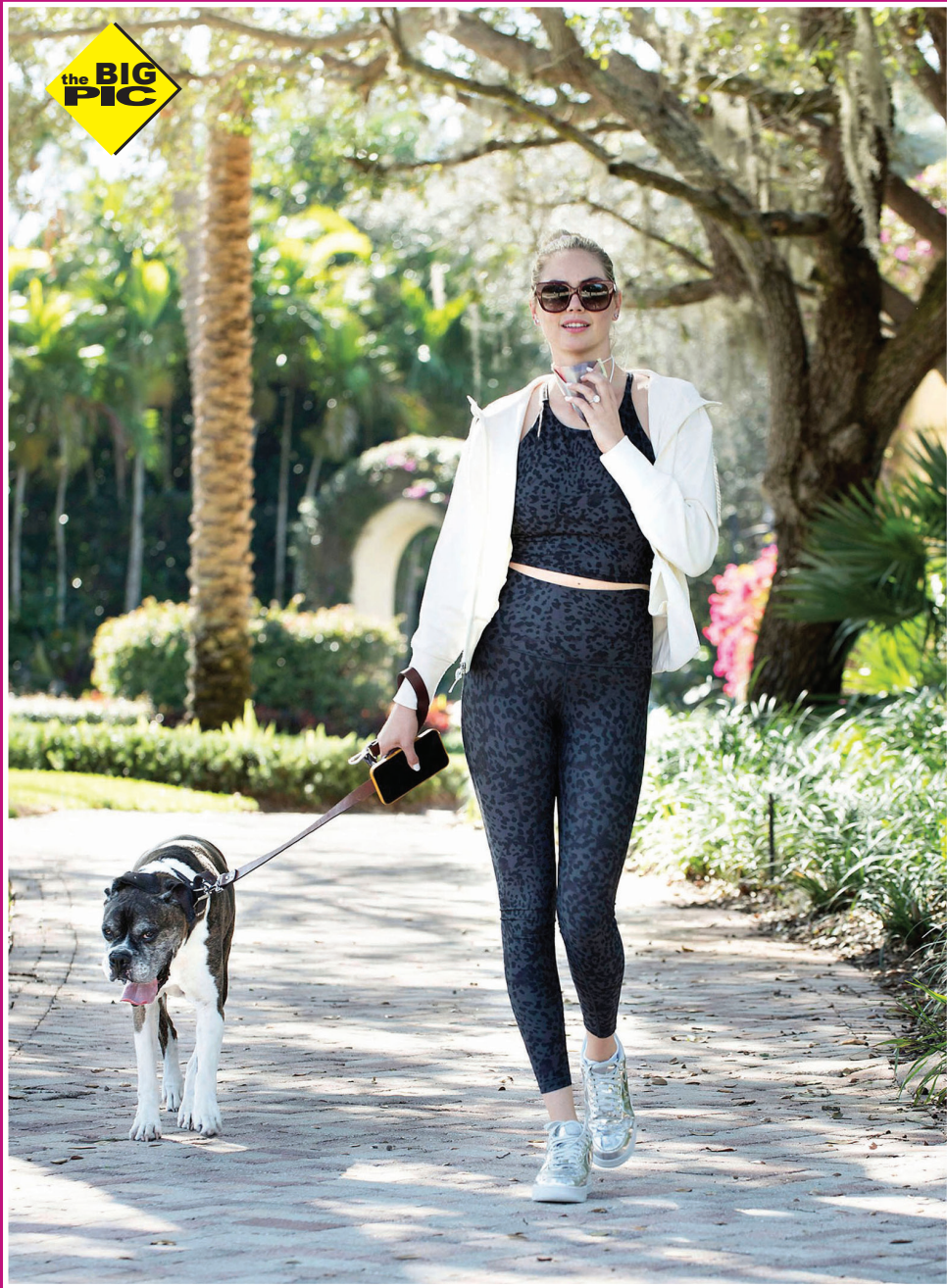
ANIMAL ATTRACTION! Actress Kate Upton wore animal-print Old Navy workout wear as she walked her dog in Palm Beach, Florida.