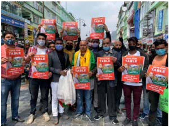
for making the municipal non-partisan and hence