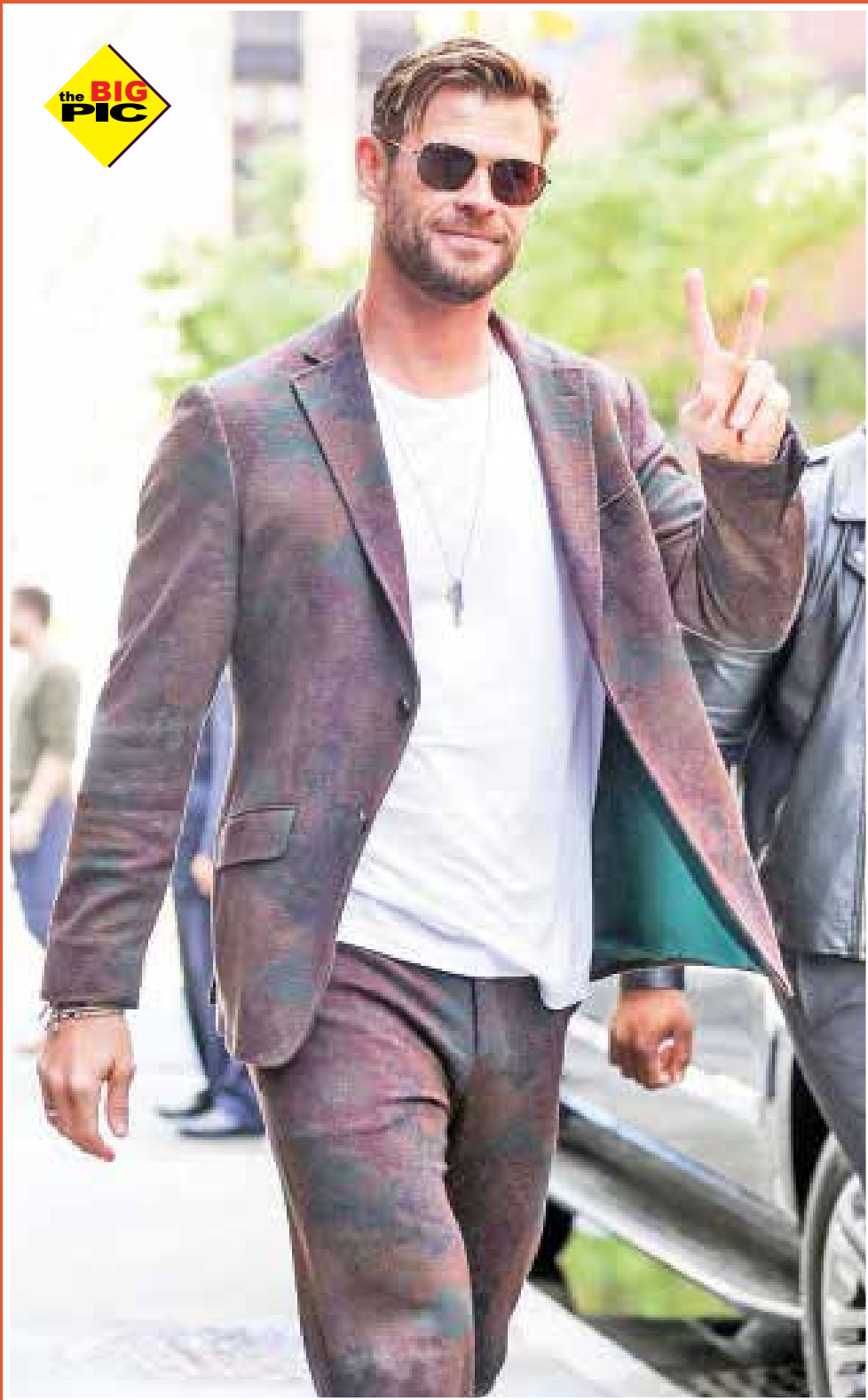
HUNKY HEMSWORTH! The Aussie actor, Chris Hemsworth sends peace and love during an outing in Manhattan.