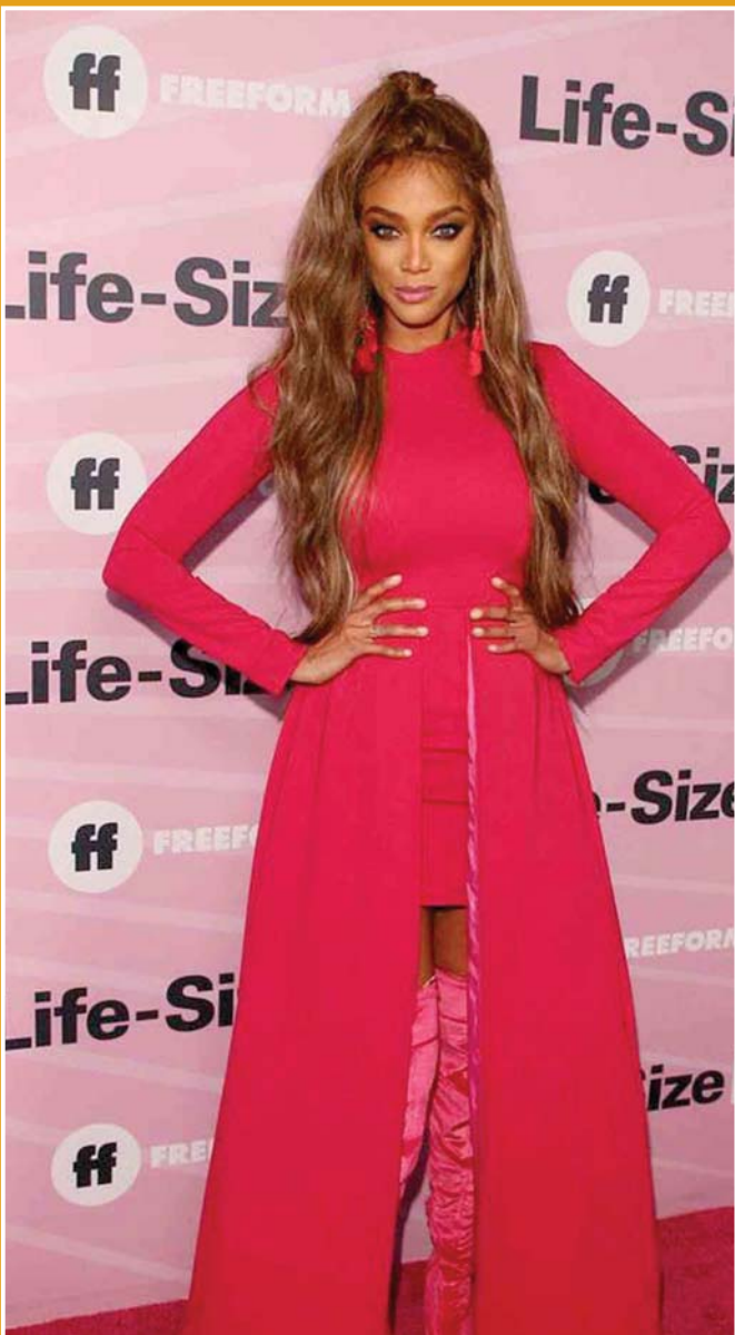
RAVISHING IN RUBY: The model/actress Tyra Banks looked ravishing as she attended the world premiere for her movie Life Size 2.