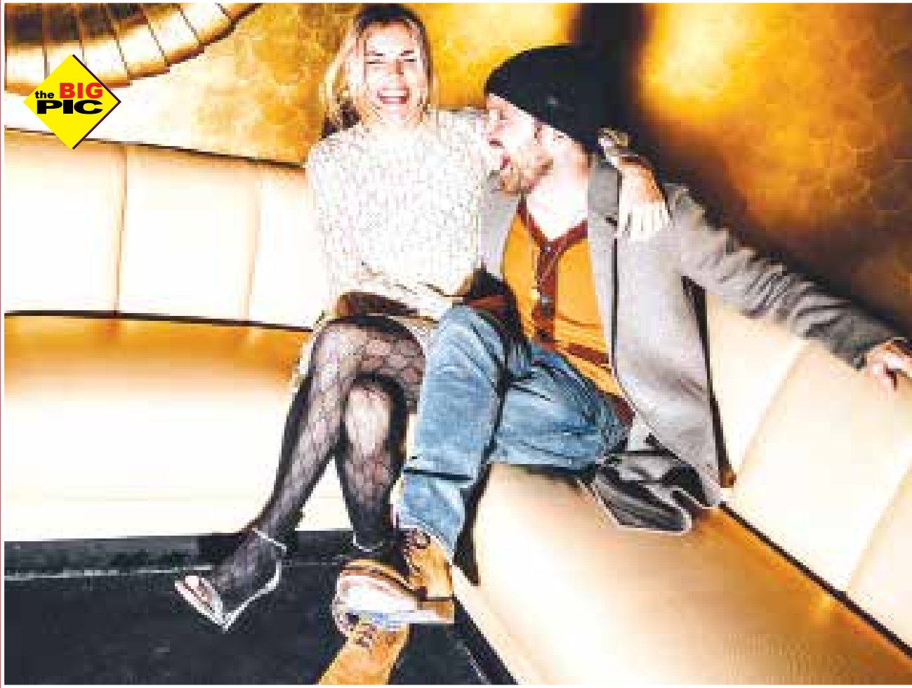
LOTS OF LAUGHS! Actors, Sienna Miller and Aaron Paul lounged at the after party for a film screening of American Woman in New York City.