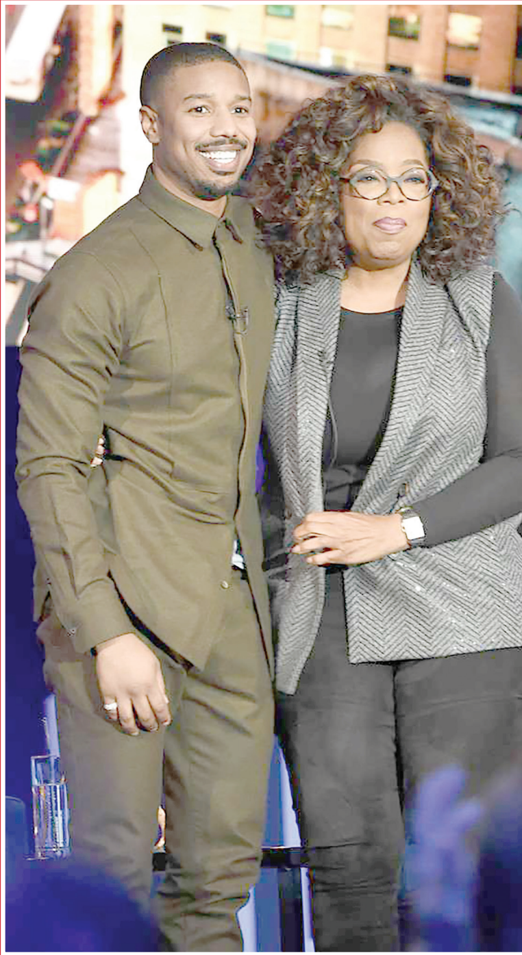
STAR POWER! The Creed actor Michael B. Jordan looks happy to be taking part in Oprah's SuperSoul Conversations in New York City.