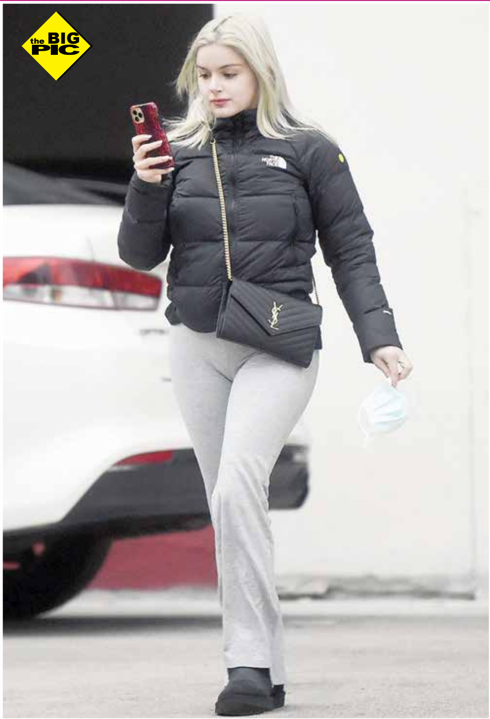
BIRTHDAY GIRL! The Modern Family actress, Ariel Winter visits a hair salon before celebrating her 23rd birthday at home in Los Angeles.