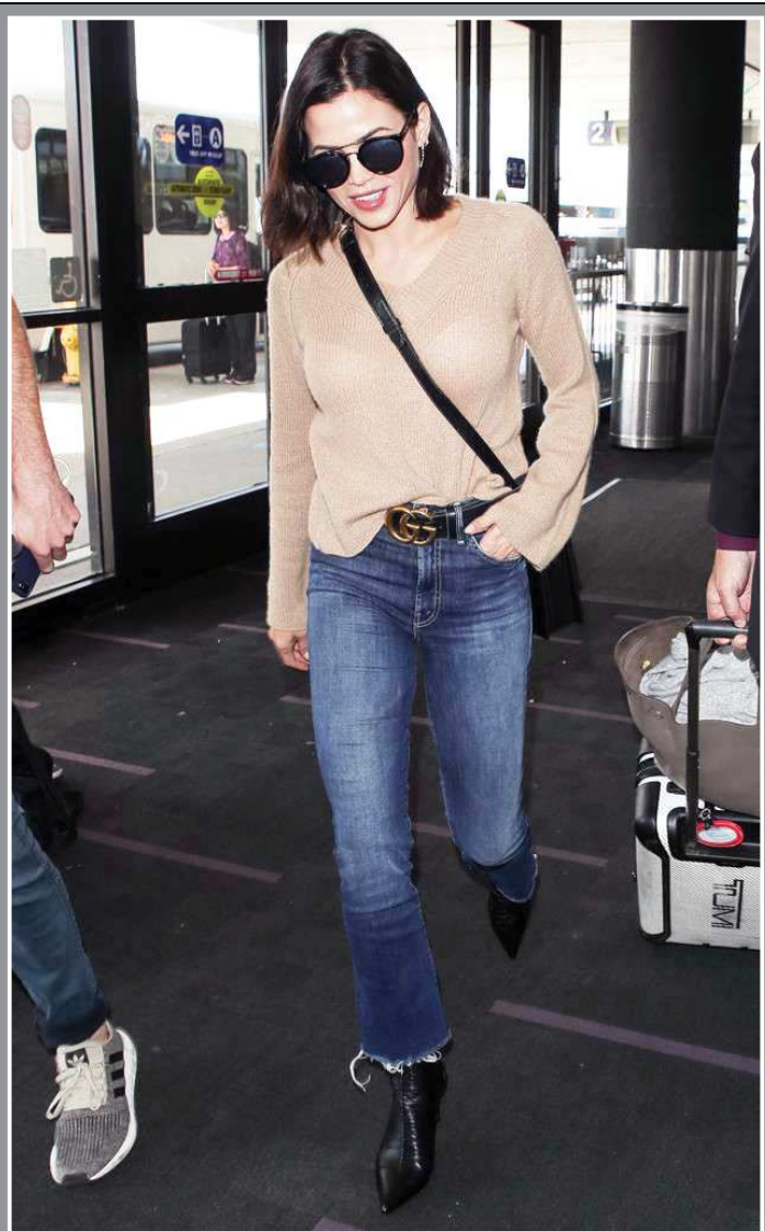
Actress Jenna Dewan is seen wearing a beige sweatshirt, cool pointed-toe boots, round sunglasses and a Gucci belt in Los Angeles.