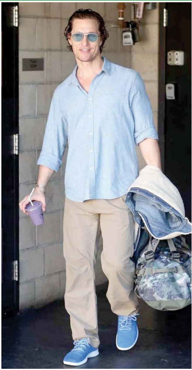
SHADES OF BLUE! Oscar winner Matthew McConaughey is spotted leaving the gym after a workout in West Hollywood, Calif.