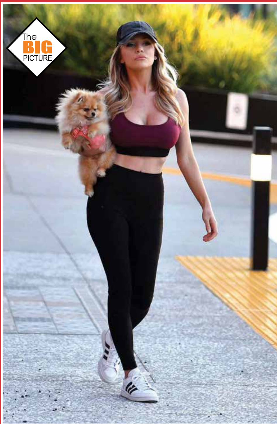
PUPPY POUT! Model Courtney Stodden showed off their toned physique while carrying their dog.

"Because singing and performing have been my whole life, my primary goal is to keep healthy so I can continue singing for the next decade or longer," Nicks' statement said.