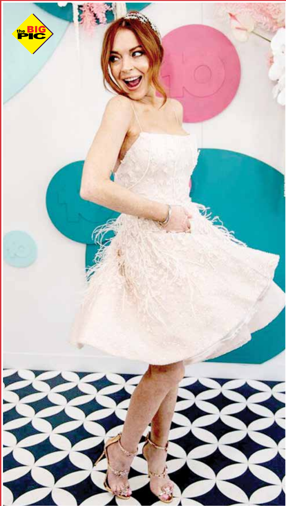
HAPPY TWIRLS! The actress, Lindsay Lohan gets excited at the Channel 10 Marquee on Melbourne Cup Day in Melbourne, Australia.