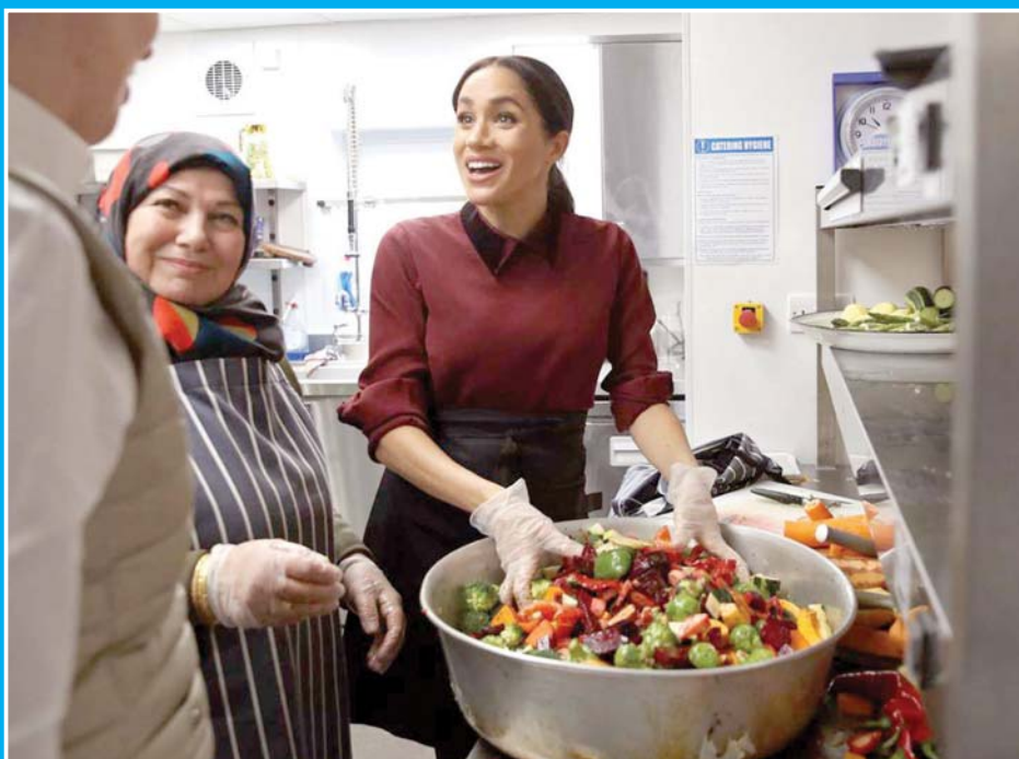
DIG IN! THE DUCHESS OF SUSSEX, MEGHAN MARKLE, HELPS OUT DURING HER VISIT TO THE HUBB COMMUNITY KITCHEN IN LONDON.