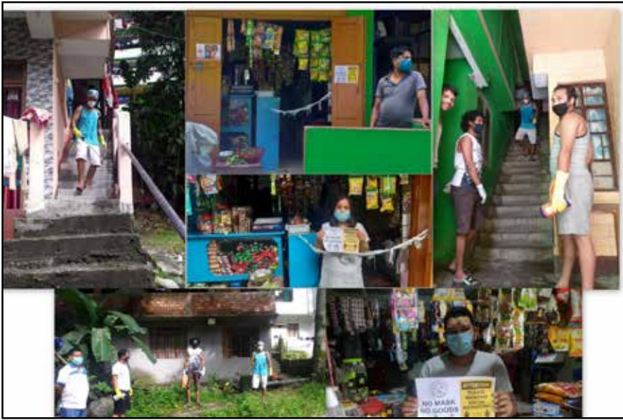
Nagar Panchayat, took sanitizing materials morning. Members of the Samiti who prompt action and sent to Shantinagar this