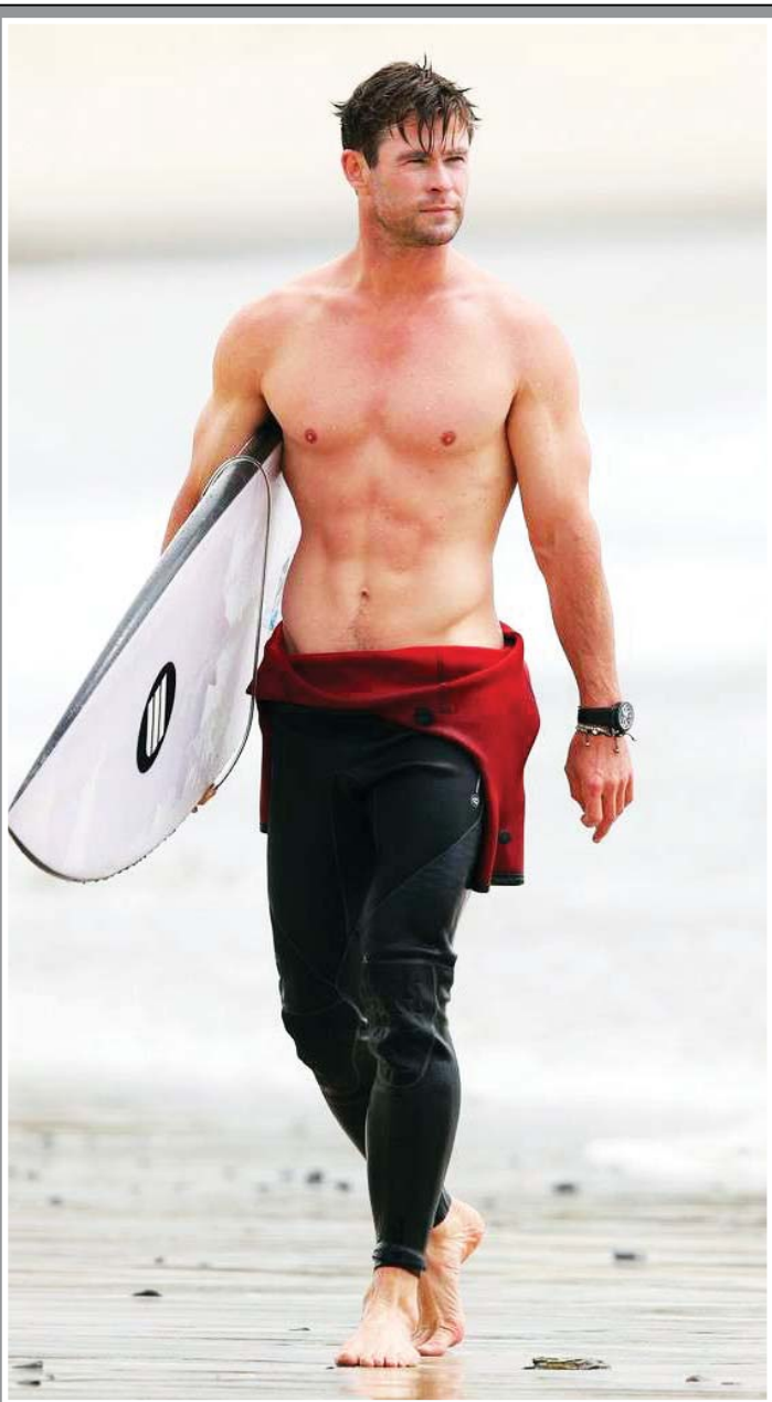
SURF'S UP! Australian actor Chris Hemsworth shows off his fit body while surfing at the beach in Byron Bay, Australia