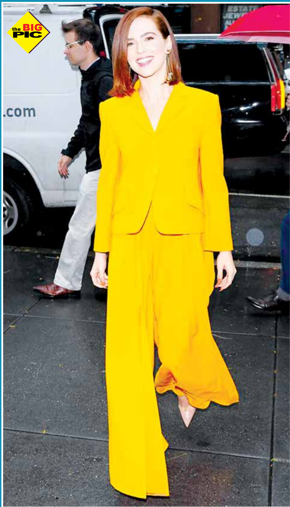
VIBRANT VIBES! The actress, Zoey Deutch is bursting with brightness in an orange pant suit on a rainy day in New York City.

Feige will again take creative charge on Spider-Man 3, this time with Disney putting up 25% of the budget. The deal also entitles Disney, who already owns 100% of the Spider-Man merchandise rights, to 25% of net gross when this next Spider-Man swings into theaters July 16, 2021.