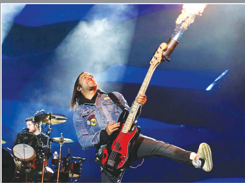
LIGHT 'EM UP! The Fall Out Boy guitarist, Pete Wentz, is on fire as he performs with the band during the Reading Festival in England.