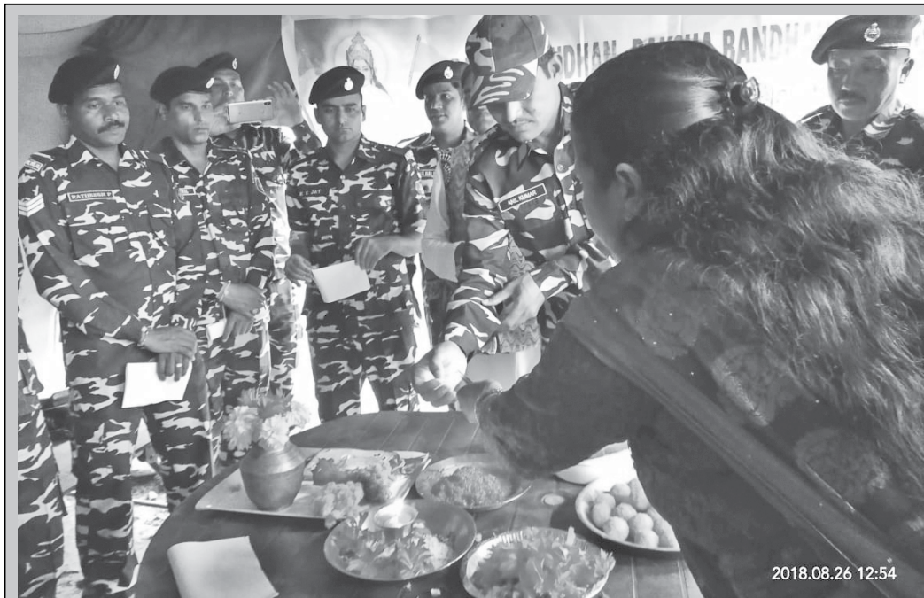
BORDER BROTHERS: 30 members of the Nepali Sanskriti Sangrangan Sangh from Soreong, West Sikkim, visited SSB jawans stationed on the Indo-Nepal border checkpost at Chewa Bhanjhyang in West Sikkim, on Sunday to tie Rakhis on them to mark Raksha Bandhan.