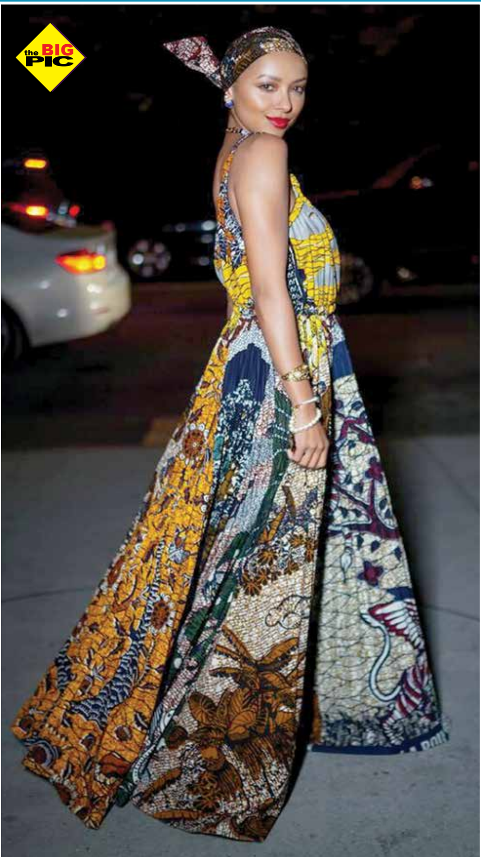
ALL THE COLORS! The actress, Kat Graham stuns the night in a detailed multi-print dress at the 2019 Guggenheim International Gala in New York City.