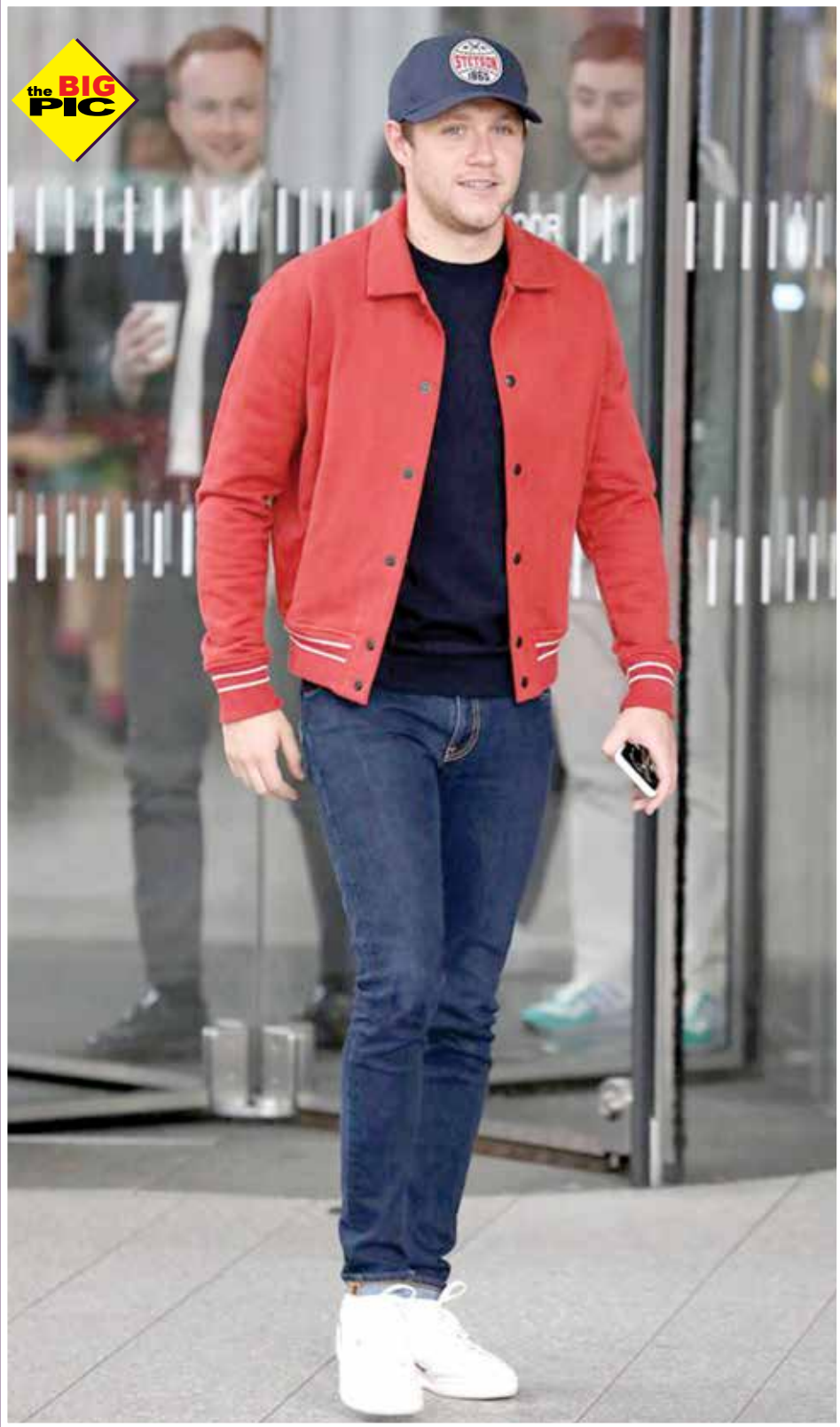
OUT AND ABOUT! The Irish singer, Niall Horan rocks a red, white and blue ensemble as he leaves Talksport radio studios in London.