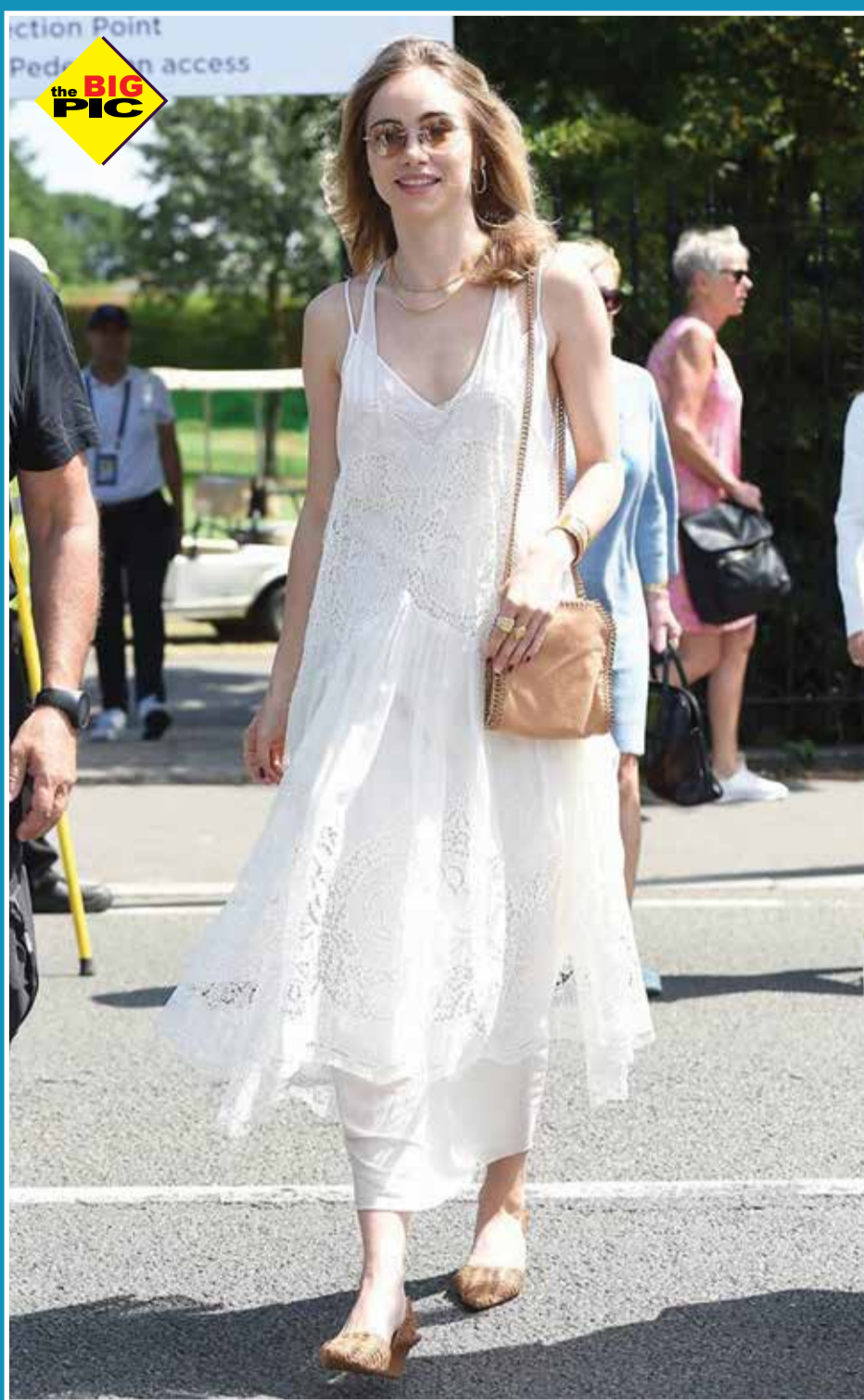
GLOWING AT WIMBLEDON! The actress, Suki Waterhouse is in full glow while attending the tennis championships in London.