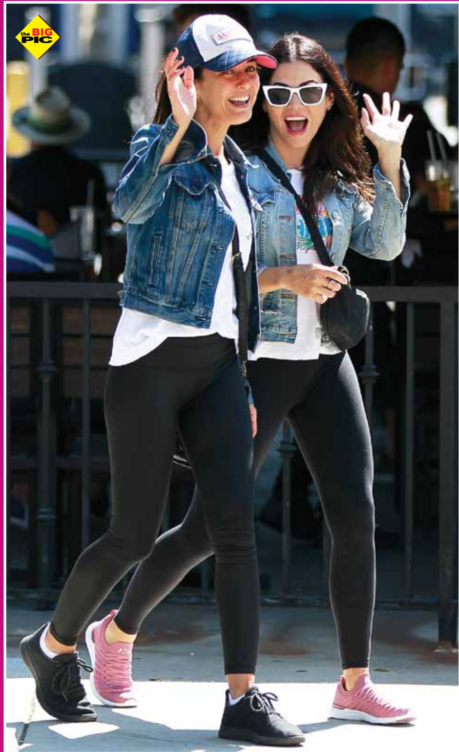
GIRLS DAY OUT! Twinsies, Emmanuelle Chriqui and Jenna Dewan waved to the paparazzi while out in Studio City, California, in matching outfits.