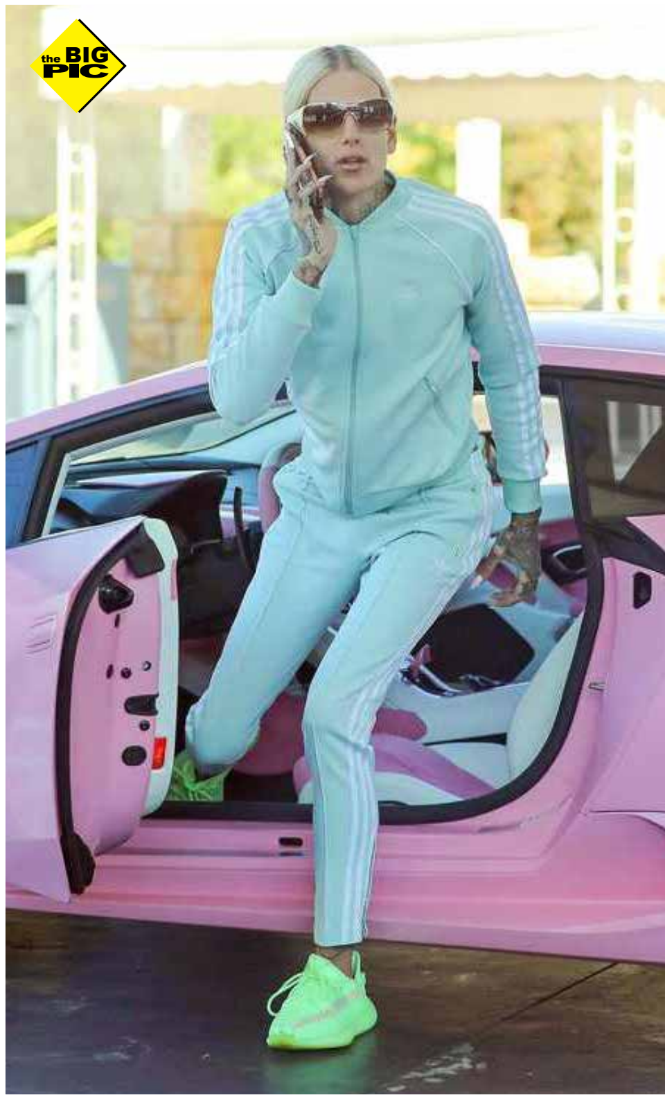
ON THE GO! The makeup mogul, Jeffree Star fills up his pink Lamborghini at a gas station wearing a blue Adidas tracksuit with neon green Yeezy Boost 350 sneakers.