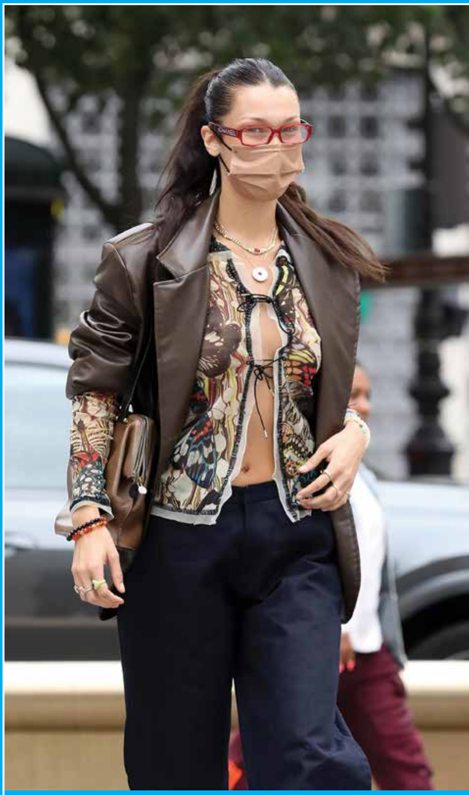
MASK UP! Model Bella Hadid was spotted visiting the Francois Pinault exhibition in Paris.