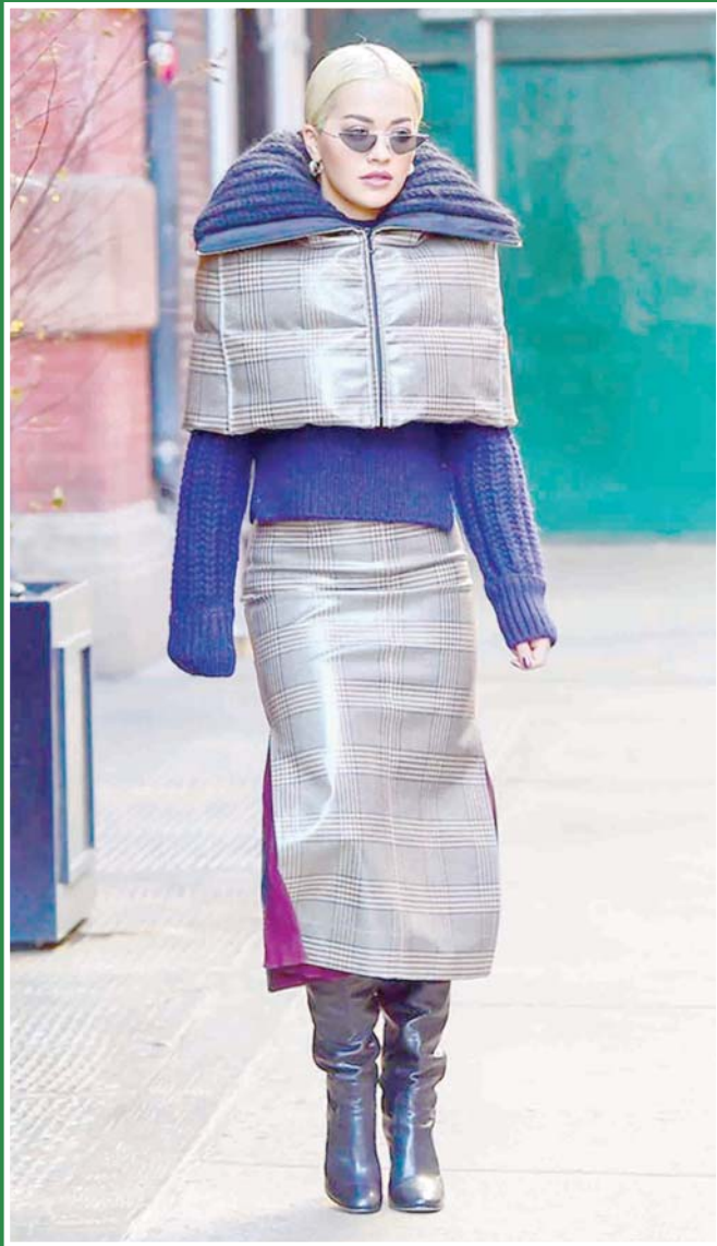
FASHIONISTA! Singer Rita Ora rocks a fab Fendi look while out and about in New York City.